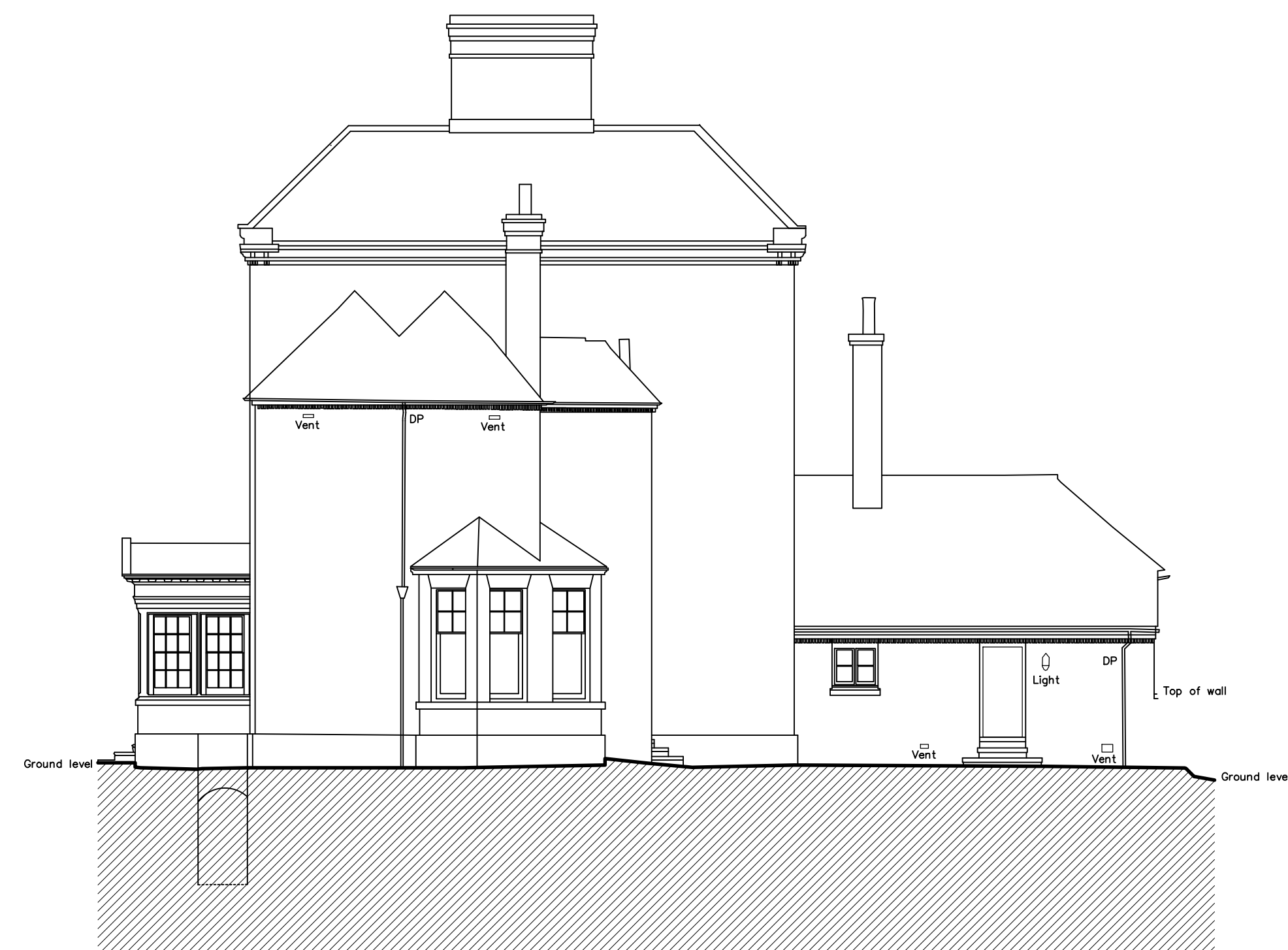
Existing Elevation 4