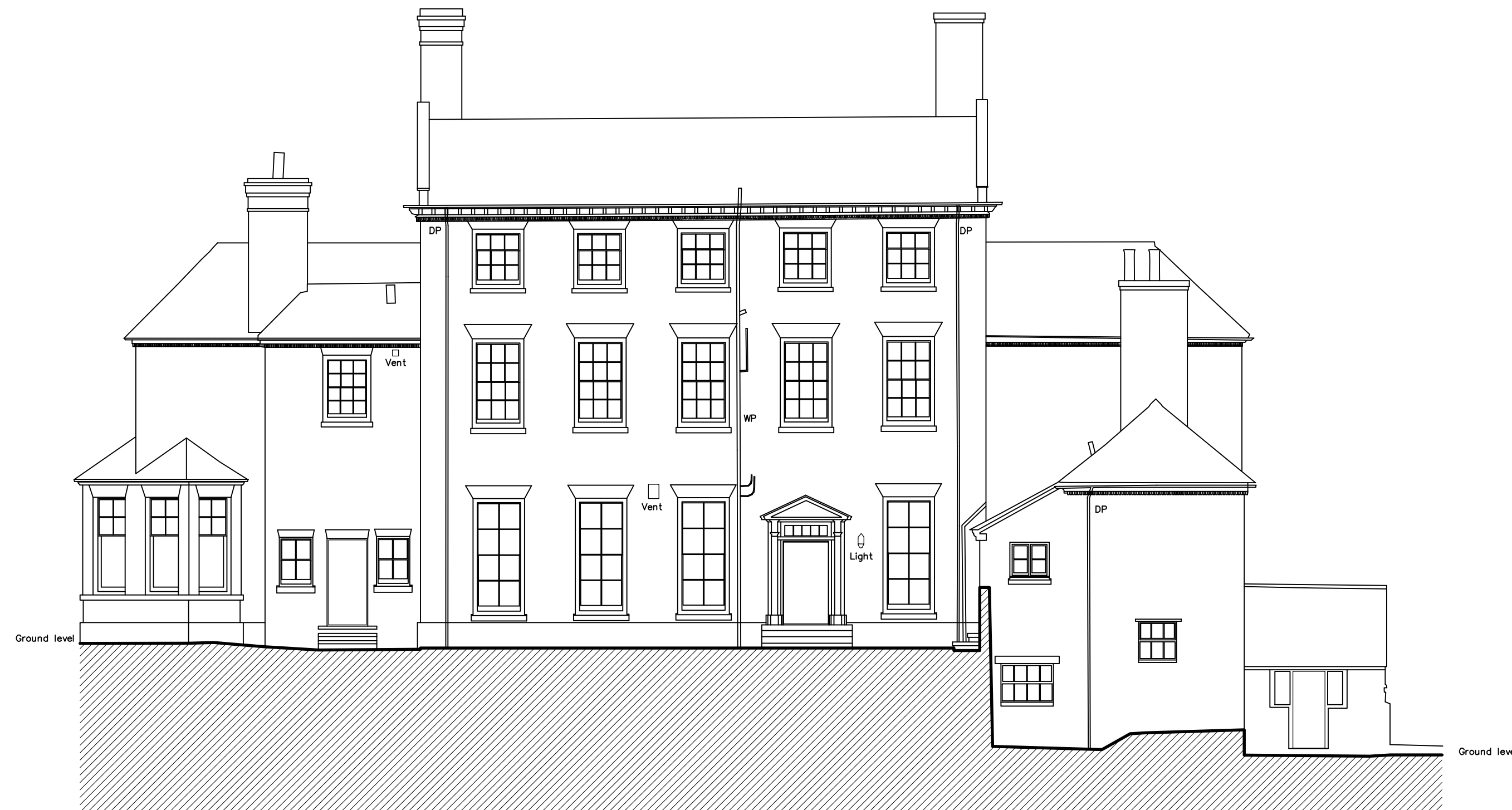
Existing Elevation 3