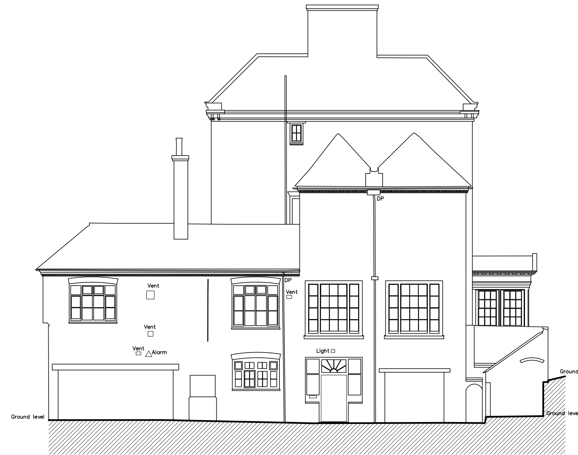
Existing Elevation 2