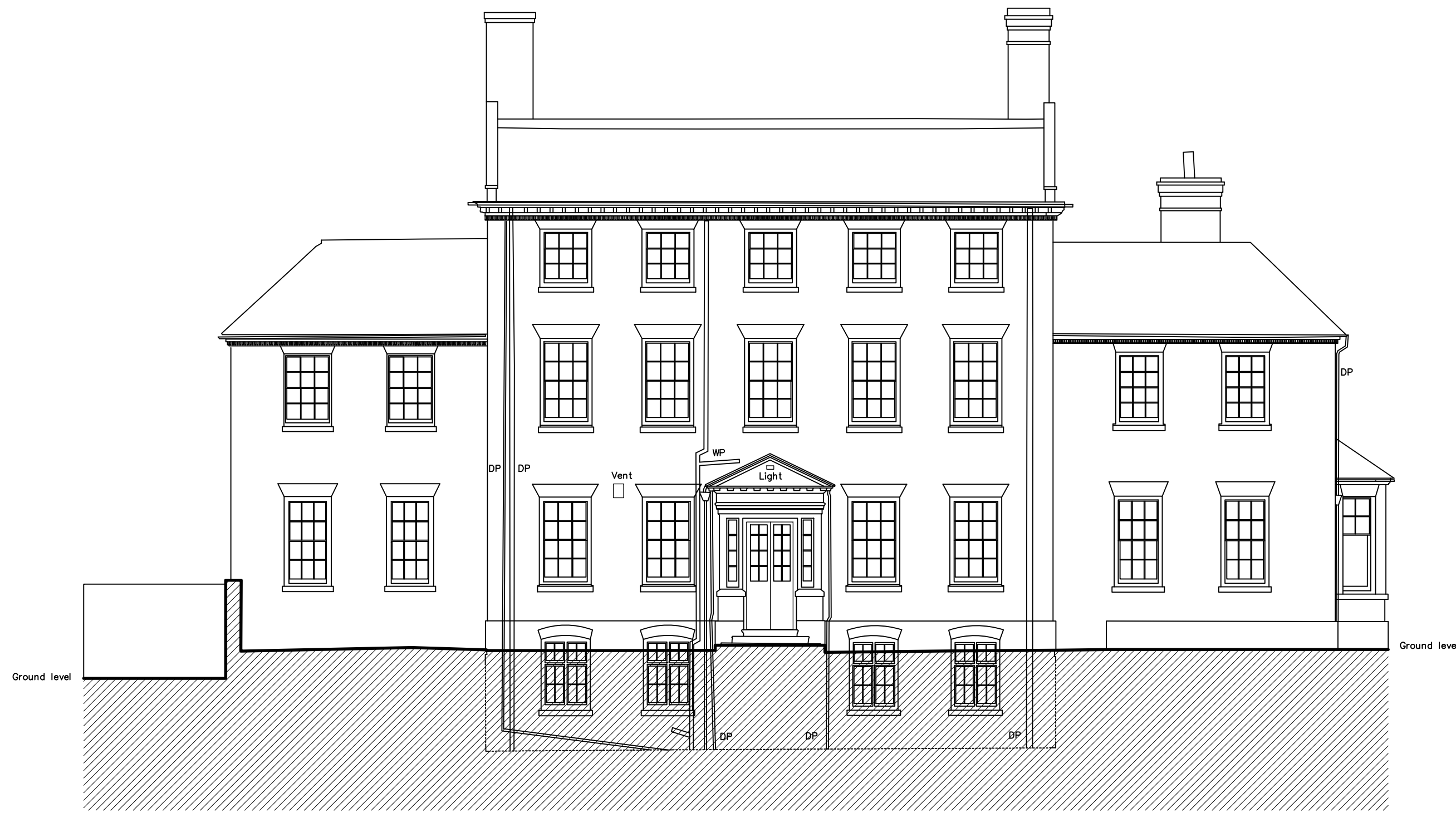
Existing Elevation 1